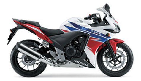
Fig. 1 External appearance of CBR400R.

torque characteristics at everyday low and medium engine speeds, while achieving unconstrained performance at high speeds with maximum power generated at 9,500 rpm. A roller rocker arm, which is an effective means of helping to reduce friction, and a silent chain were adopted in the valve train. The balance between piston stiffness, strength, and lightness was enhanced by computer analysis. In addition, the CBR600RR features various technologies adopted from higher grade models, such as friction-reducing surface treatment technology for the piston pins and connecting rods. Low vibration and compact size were achieved by adopting a 180°-phase crankshaft and laying out the balancer at the rear surface. This engine achieves both excellent fuel economy and environmental performance. Figure 1 shows the external appearance of the CBR400R.