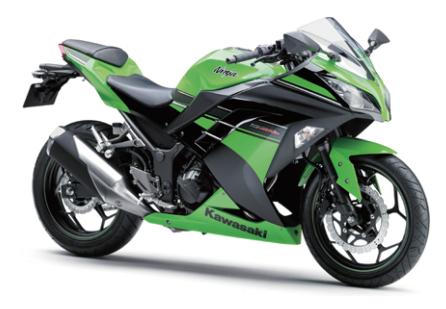
Fig. 7 External appearance of Ninja 250.

cm<sup>3</sup>, water-cooled, 4-stroke, DOHC, 4-valve, parallel 2-cylinder engine. The bore \times stroke dimensions are 62.0 \times 41.2 mm and its compression ratio is 11.3. Lightweight pistons using an aluminum die-cast sleeveless plated cylinder and a hard alumite coating ensure high durability. The fuel injection system adopts injectors that atomize the spray to a droplet diameter of 60 µm, thereby helping to improve combustion efficiency. Dual throttle valves that control the intake air precisely and efficiently ensure linear and natural response at all speeds. The intake air volume was increased by setting a sub-throttle valve diameter of 40.2 mm. As a result of these innovations, this motorcycle is easy to handle while touring and also has an exciting sensation of power for enjoyable sporty riding. Figure 7 shows the external appearance of the Ninja 250.