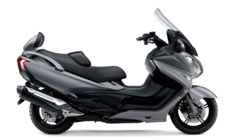
Fig. 6 External appearance of Skywave 650LX.

(i) Ninja 250: This motorcycle is installed with a 248