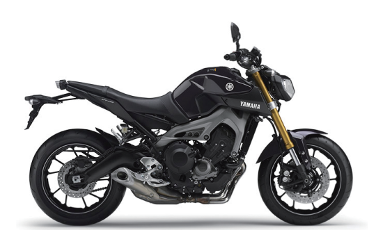
Fig. 3 External appearance of MT-09.

(ii) YZ250F (racing model): This motorcycle is installed with a newly designed 249 cm<sup>3</sup>, water-cooled, 4-stroke, DOHC, 4-valve, single-cylinder engine. The bore × stroke dimensions are 77.0 \times 53.6 mm and its compression ratio is 13.5. The carburetor used by the 2012 model has been replaced by fuel injection. The number of intake valves was reduced from five to four and titanium was adopted for both the intake and exhaust valves. The valve diameter was set to 31 mm on the intake side and 25 mm on the exhaust side. A narrow valve included angle of 23.75° was set to create a compact combustion chamber. Double-ring cast aluminum pistons were adopted to reduce power loss through lower weight and sliding resistance. Optimizing the intake and exhaust ports and the