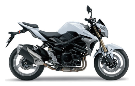
Fig. 5 External appearance of GSR750ABS.

same power characteristics as the model for outside Japan while ensuring easy handling for urban streets and powerful acceleration. Figure 5 shows the external appearance of the GSR750ABS.