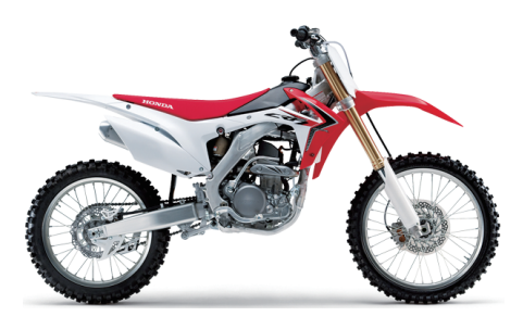
Fig. 2 External appearance of CRF250R.

bore×stroke dimensions are 78.0×59.1 mm and its compression ratio is 11.5. This is a fuel-injection engine with a downdraft layout intake system. A narrow valve included angle of 26.5° (intake: 13°, exhaust: 13.5°) enables rapid combustion and a compact combustion chamber shape. Cast aluminum pistons, plated cylinders, and fracture splitting connection rods were adopted from the standpoints of reducing weight as well as improved heat dissipation and production accuracy. Vibration was reduced by adding a balancer. The intake system uses an unequal-length funnel to boost torque characteristics and an offset-cylinder design to reduce sliding resistance. A 3-into-1 exhaust system, which integrates the exhaust pipe with a muffler containing three internal expansion chambers, helps to centralize the mass while improving exhaust efficiency. The synergistic effect of these innovations helps to improve both dynamic performance and fuel economy. Furthermore, the D-MODE system allows the rider to choose between three throttle control mapping settings in accordance with preference and the riding situation. The three settings are designed to achieve easy handling and sharper response in everyday riding on urban streets and other environments. Figure 3 shows the external appearance of the MT-09.