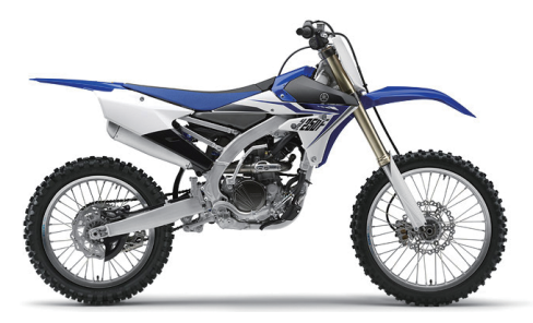
Fig. 4 External appearance of YZ250F.